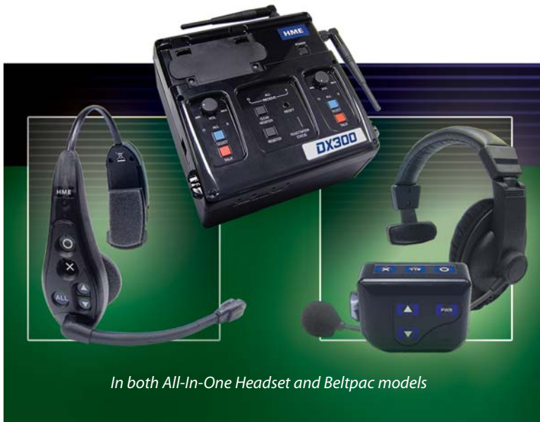
In both All-In-One Headset and Beltpac models

The basic DX300 five-coach system includes five headsets, three beltpac, a beltpac battery charger, a base station and a carrying case.